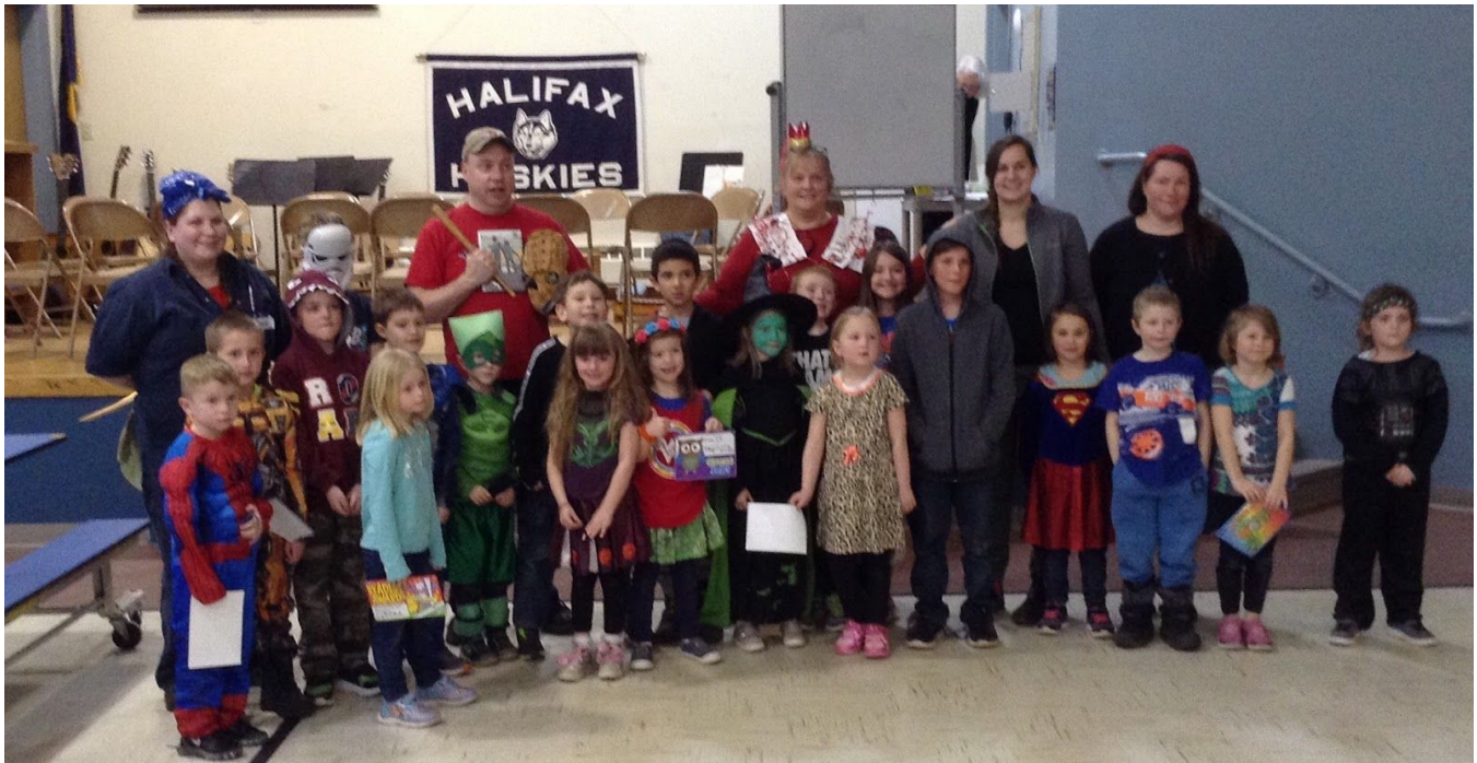
Dress as your favorite literary Hero or Villain